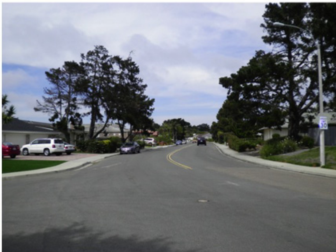
8500 Prestwick Drive