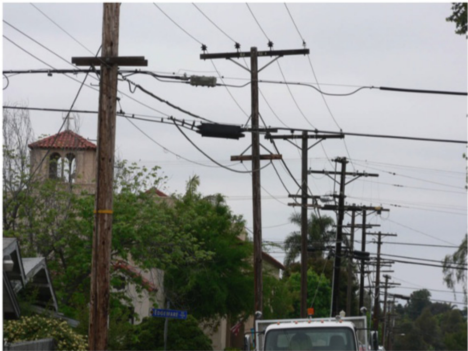
Alder and Marlborough – Kensington Community Church